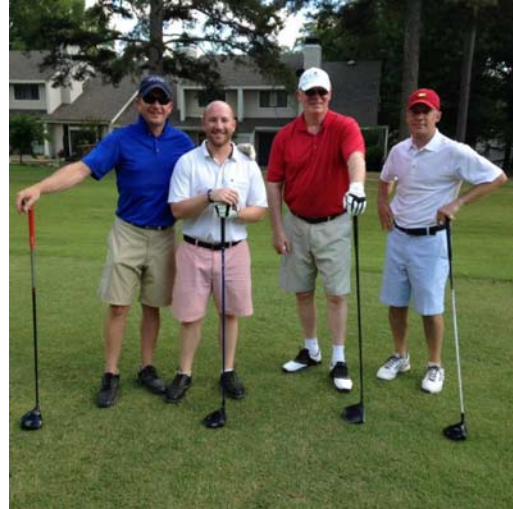
CEO Summit Recap May 14