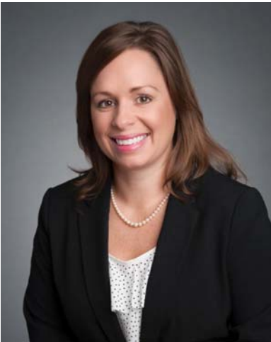
Mid-South Regional Chapter Update Page 28