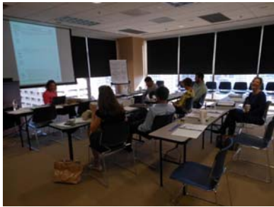
Fall 2015 Training Classes Announced Little Rock & Northwest Arkansas Page 32