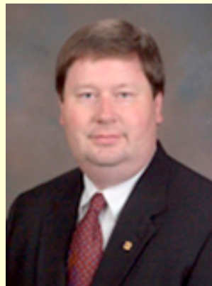
Executive Vice President | Managing Director CBRE | Valuation & Advisory Services